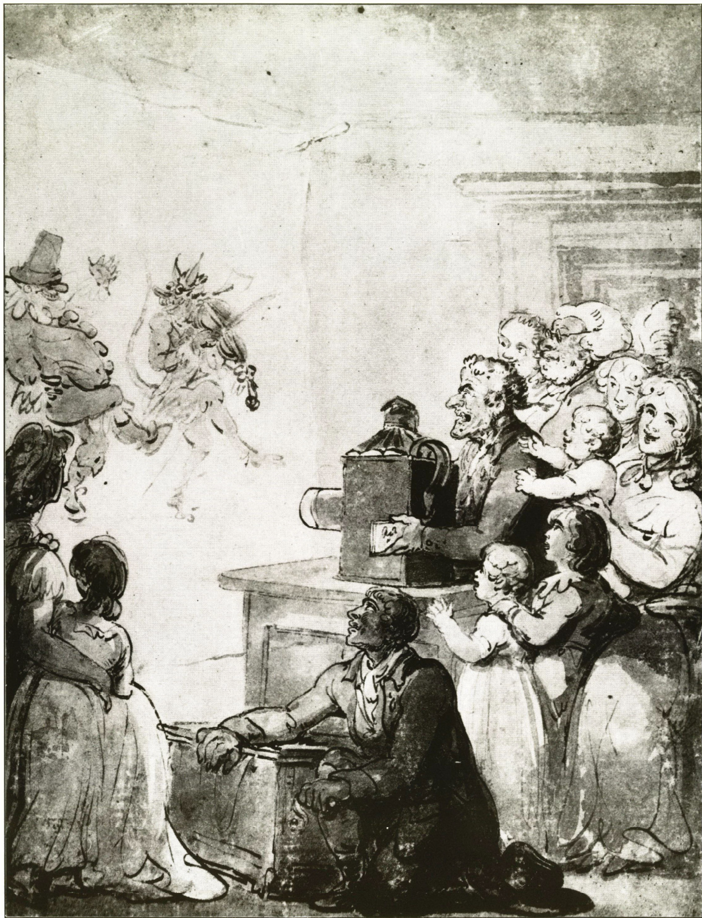
Original painting attributed to Rowlandson and dated c.1799