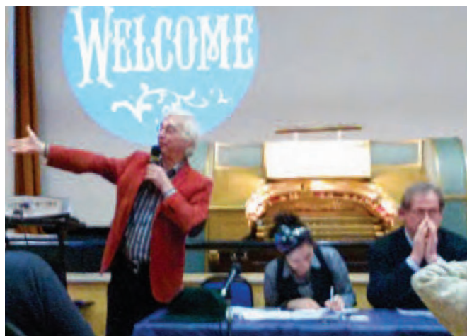
"Welcome to the 2015 AGM" GA