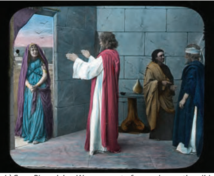
b) Syro-Phoenician Woman, part of several narrative slide sets produced in 1904 by the Limelight Department.