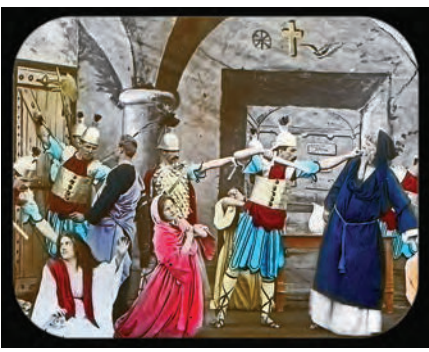
c) Massacre of Bishop Stephen in the Catacombs – thirty two of these Life Model slides were produced by the Limelight Department and used in part of a film and slide presentation.

department's stock-in-trade as three motion picture camera-cum-projectors and three lantern slide projectors plus nine gramophones. He continued: 'I had erected at the rear of THQ a very commodious and well-lighted studio for the production of life model slides, these being connected with and explanatory of the Army's Christ-like mission, socially and spiritually. He was a spiritually of the Army's Christ-like mission, socially and spiritually.