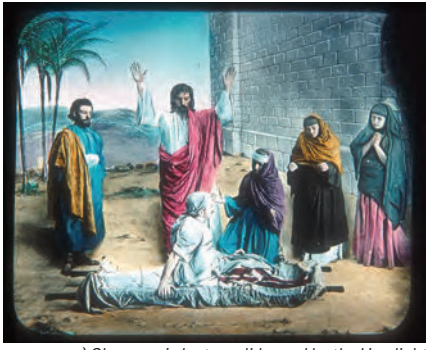
a) Glass magic lantern slide used by the Limelight Department depicting the raising of Lazarus.