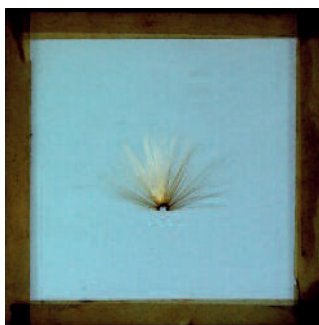
Slide from the Crabtree Collection – mounted seeds of plants