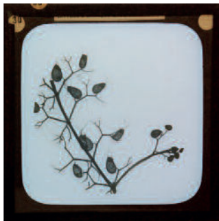
Slide 30 of insectivorous plants

To mark the upcoming workshop in Antwerp on 'creative reuse of the magic lantern' (28–30 October 2016), film artist Sarah Vanagt was invited to develop a project inspired by the magic lantern slides and projectors in the Vrielynck collection. An exhibition at MHKA (from 28 October until 13 November 2016) will display original lanterns and slides to accompany her new film. To this end, Sarah is looking for original lantern slides that conserve organic material (specimens): not only flowers, leaves, seeds and algae, but also insects and feathers (such as in the famous Carpenter & Westley series). She would welcome any information on this type of slides as well as images. Please contact Sarah Vanagt ( info@balthasar.be ) or Nele Wynants ( nele.wynants@uantwerpen.be ).