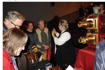
People gather round afterwards

slides of Leiden in the small – and very red (as you can see in the photos) – lecture room until around midnight. Sarah told the international audience about the history of the photographic slide. Even the people from the Archive were amazed at the beauty of the projected slides. Watch out for other presentations – they are well worth catching.