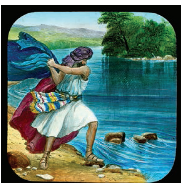
The prophet Elisha From 'When peace like a river'