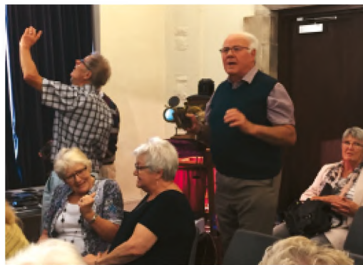
The 2019 Bristol 'Bash'